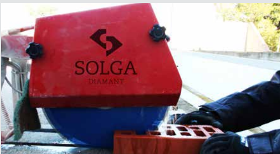
TABLE SAW BLADES (WET CUTTING)